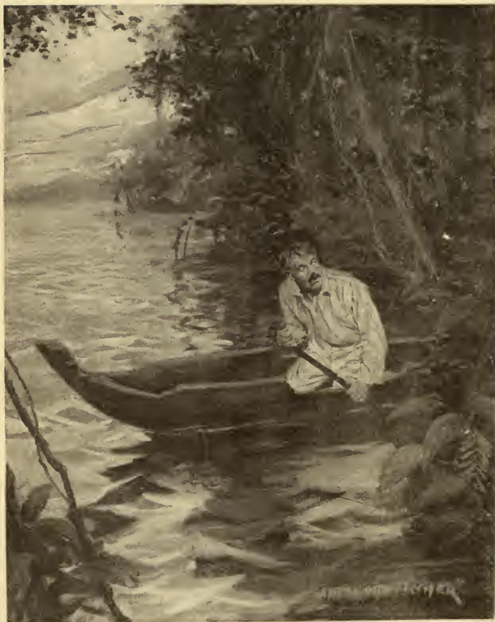
“It was a leaky and abandoned dugout, and he paddled slowly”